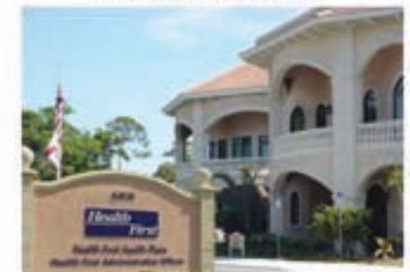
Health First - Rockledge

Coastal Mechanical Services is a nationally ranked Top 100 Mechanical Contractor specializing in the Design/Build, Construction & Service of HVAC, Piping, Plumbing and Process Systems for commercial, industrial, and institutional sectors.