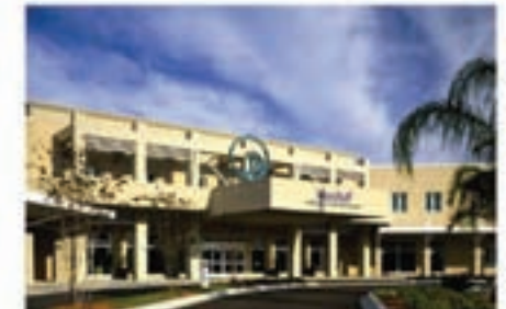
Wuesthoff - Melbourne