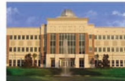
F.I.T. - Melbourne

Plumbing • HVAC Mechanical Contractors 394 East Drive Melbourne, FL 32904 P: 321-725-3061 F: 321-984-0718